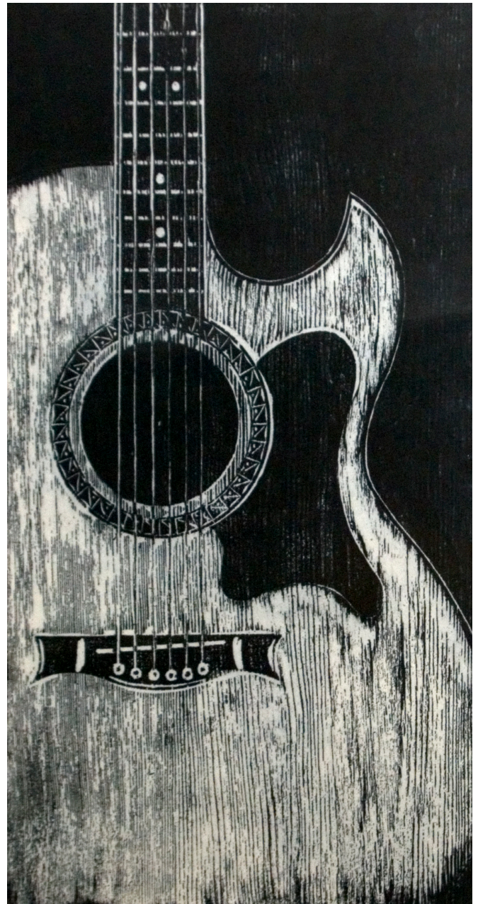
Gregg Tracey Florentine, 3/7 A. P. 13.5x23.5", woodblock print $250