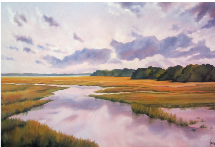
Lynn Misner Reflections 24x36", oil on canvas $1200 Now $750