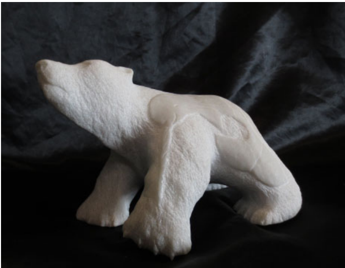
Esau Kirpanik, Igloolik Standing Bear, White Marble 8" Long, 4.5" High, 3.5" Wide $1300

Kirpanik is a master carver from Igloolik who works primarily with white marble stone to create highly realistic and detailed pieces. He has a very distinct style, often carving multiple arctic animals within a main piece. He polishes certain sections of the stone while leaving others rough to emphasize certain characteristics of the stone, or to highlight different animals. His work combines a unique modern style while still keeping with traditional Inuit heritage and possesses a beautiful sense of movement and presence. We are pleased to present these two amazing polar bears, each showing a heightened sense of movement and grace. One has a narwhal carved on one side while a seal has been depicted on the other. The second bear has a wolf and also a caribou carved on the side.