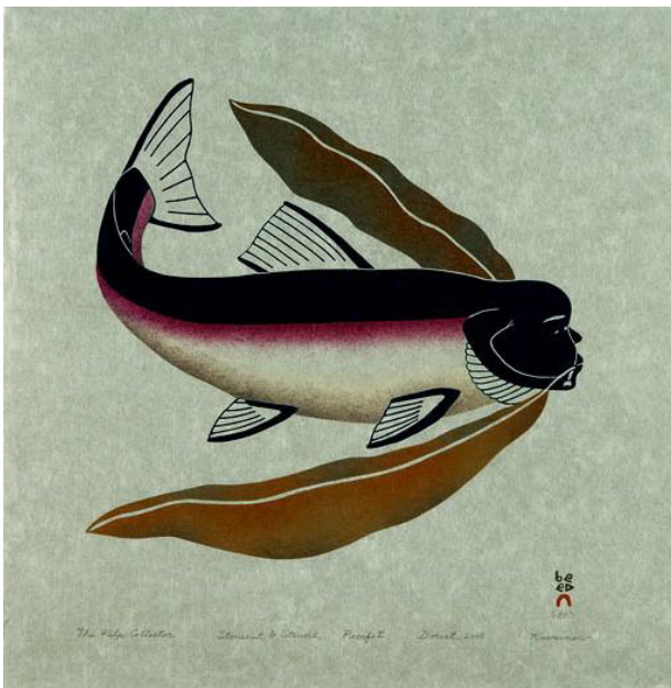
Qavaou Manumie The Kelp Collectors Stonecut & Stencil, 2005, 17"x17" $400 Now $350