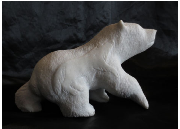
Esau Kirpanik, Igloolik Walking Bear, White Marble 8" Long, 4.5" High, 3.5" Wide $1300