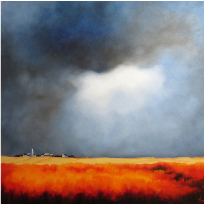
Lynn Misner Across the Plains 32x32", oil on canvas $1200 Now $750