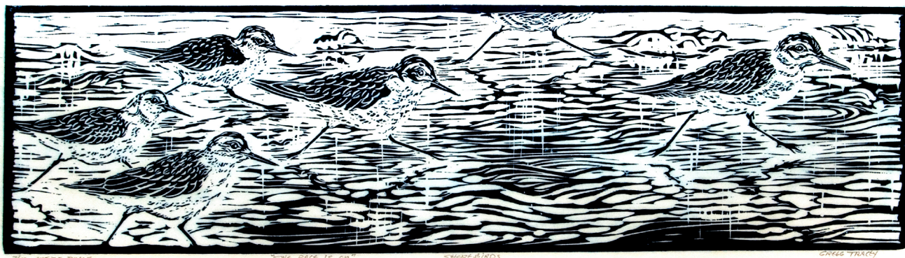
Gregg Tracey The Race is On! , 7/10 A.P. 8.5x26", woodblock print $125